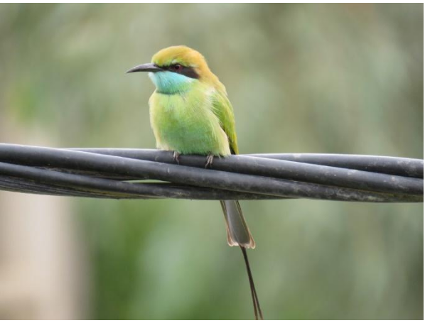
22. Green Bee-eater, Merops orientalis