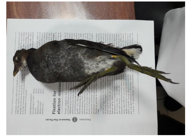
13. Common Moorhen, Gallinula chloropus