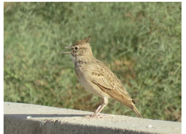
59. Crested Lark, Galerida cristata