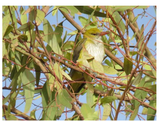
36. Eurasian Golden Oriole, Oriolus oriolus