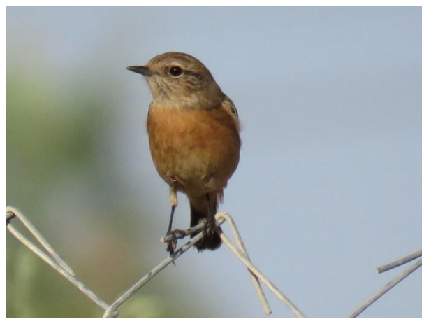
45. European Stonechat, Saxicola rubicola