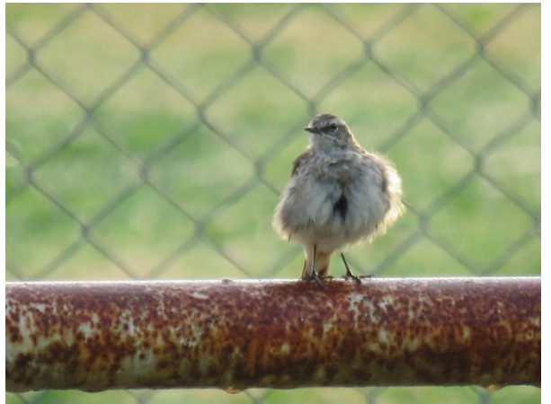
38. Water Pipit, Anthus spinoletta