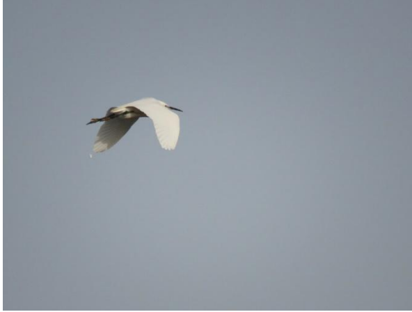
11. Little Egret, Egretta garzetta

10. Great Cormorant, Phalacrocorax carbo