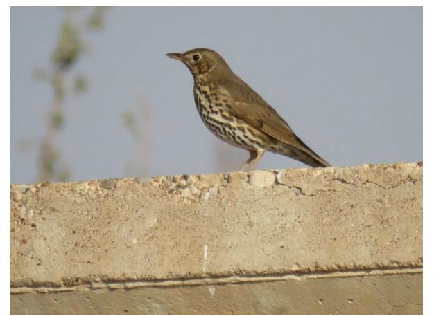
47. Song Thrush, Turdus philomelos