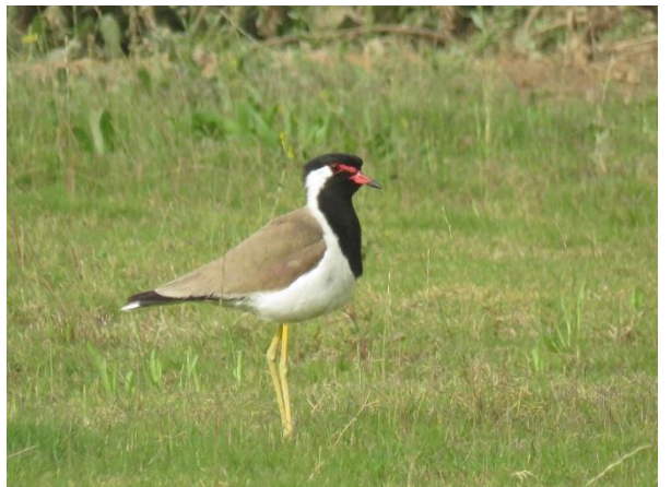
14. Red-wattled Lapwing, Vanellus indicus