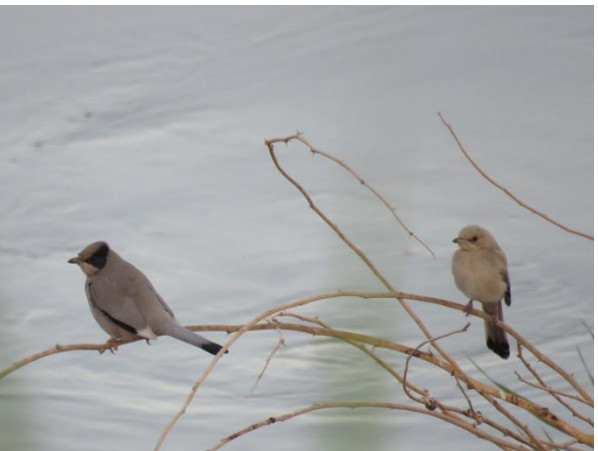
32. Grey Hypocolius, Hypocolius ampelinus