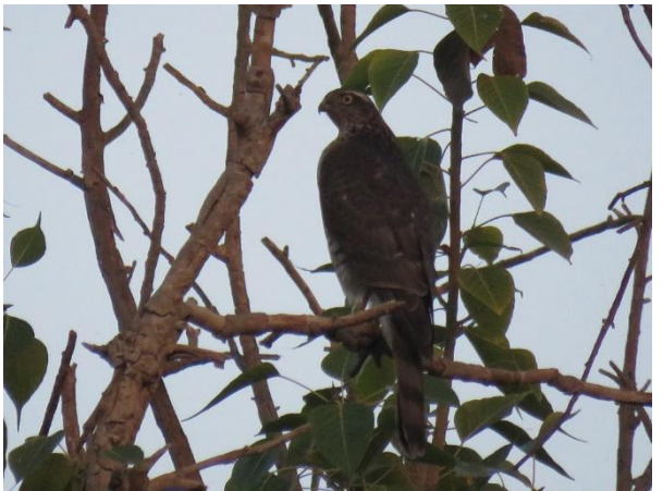
2. Eurasian Sparrowhawk, Accipiter nisus