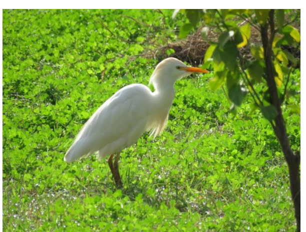
12. Western Cattle Egret, Bubulcus ibis