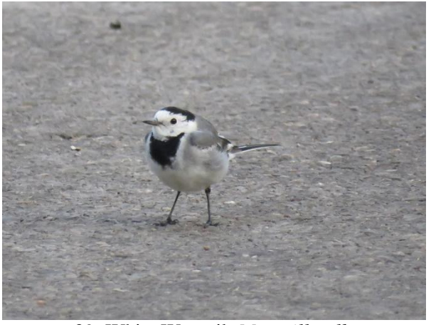
39. White Wagtail, Motacilla alba