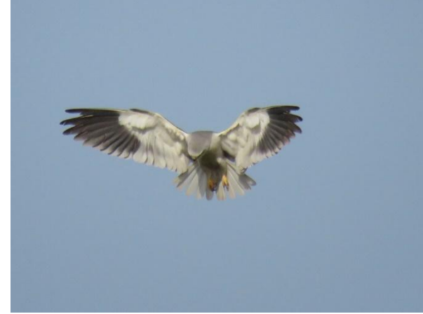
7. Black-winged Kite, Elanus caeruleus