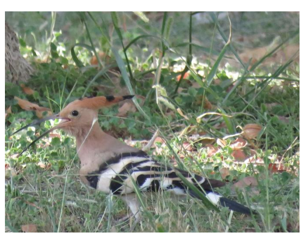
24. Eurasian Hoopoe, Upupa epops