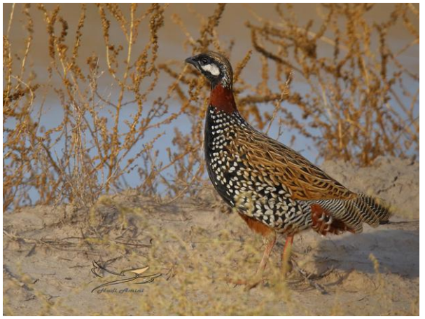
26. Black Francolin, Francolinus francolinus