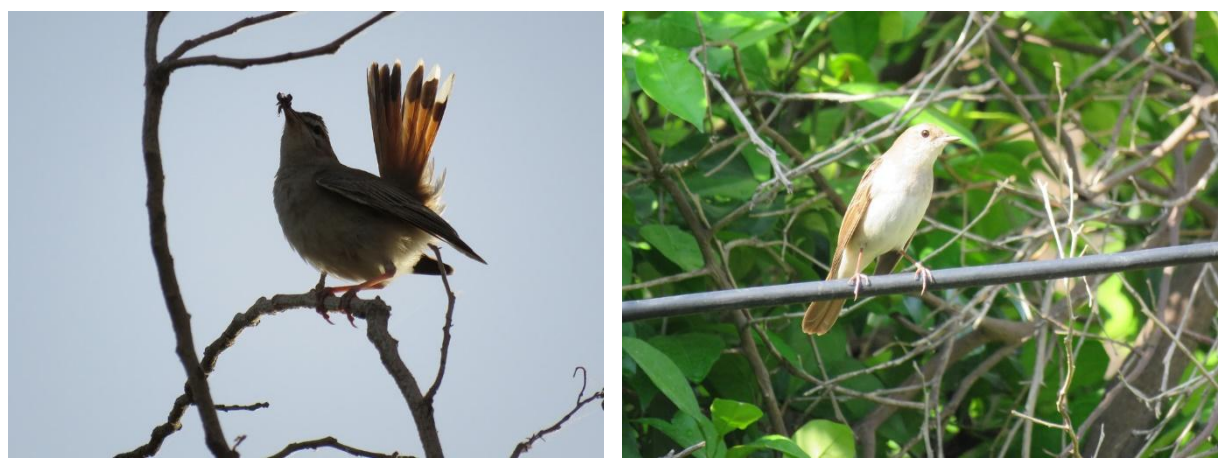
41. Rufous-tailed Scrub Robin, Cercotrichas galactotes 42. Common Nightingale, Luscinia megarhynchos