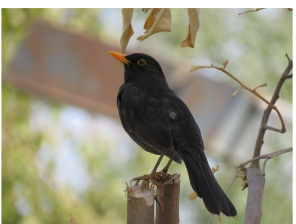
48. Common Blackbird, Turdus merula