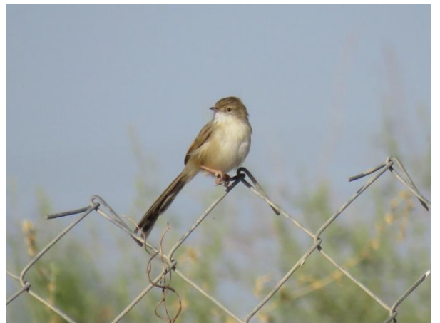
57. Graceful Prinia, Prinia gracilis