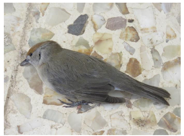
53. Eurasian Blackcap, Sylvia atricapilla