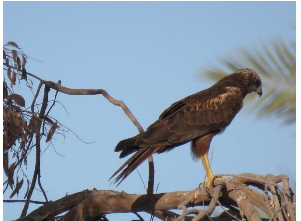
3. Western Marsh Harrier, Circus aeruginosus