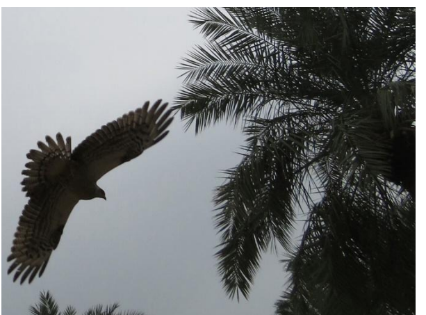
6. European Honey Buzzard, Pernis apivorus