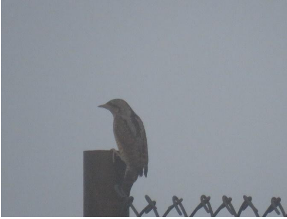
25. Eurasian Wryneck, Jynx torquilla