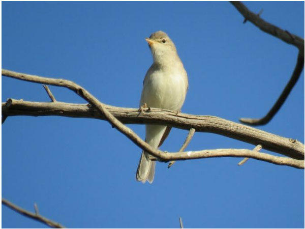
58. Eastern Olivaceous Warbler, Iduna pallida