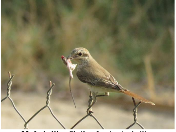
33. Isabelline Shrike, Lanius isabellinus