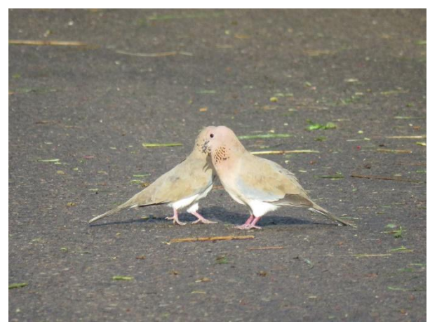
29. Laughing Dove, Spilopelia senegalensis