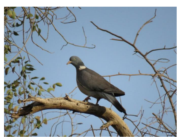
30. Common Wood Pigeon, Columba palumbus