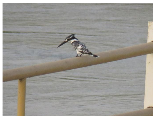
17. Pied Kingfisher, Ceryle rudis