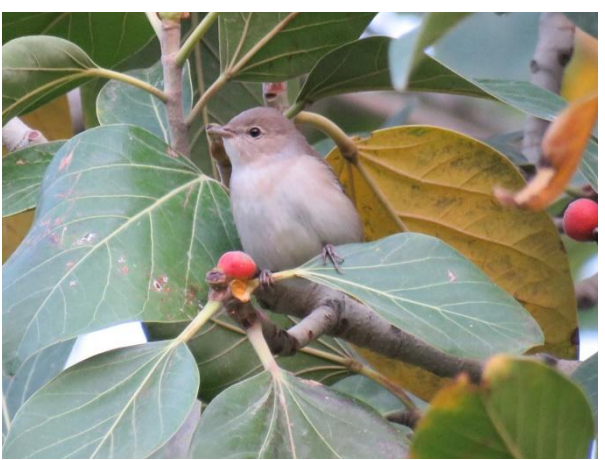
52. Garden Warbler, Sylvia borin