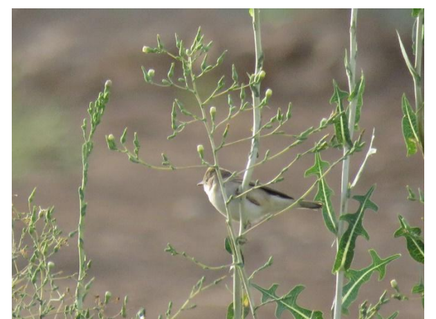
55. Desert Whitethroat, Sylvia minula