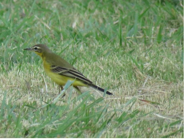
40. Western Yellow Wagtail, Motacilla flava