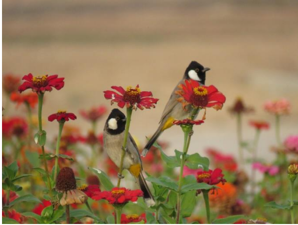
37. White-eared Bulbul, Pycnonotus leucotis