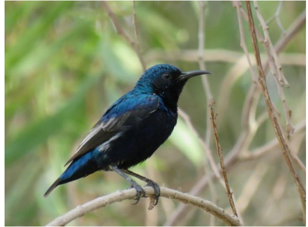
35. Purple Sunbird, Cinnyris asiaticus