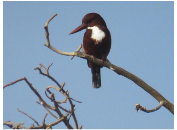
18. White-throated Kingfisher, Halcyon smyrnensis