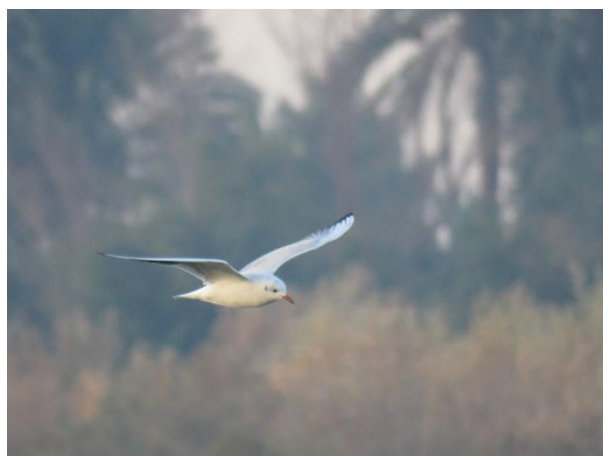
16. Black-headed Gull, Chroicocephalus ridibundus