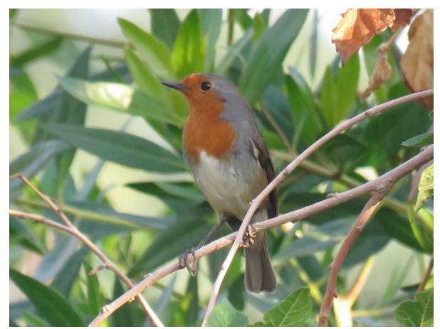
49. European Robin, Erithacus rubecula