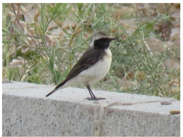
44. Pied Wheatear, Oenanthe pleschanka