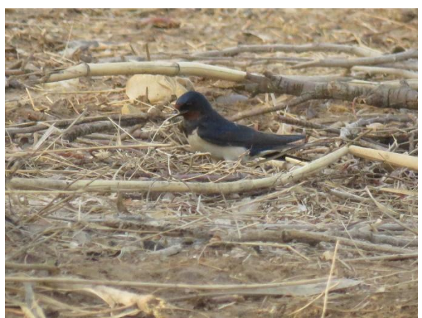
31. Barn Swallow, Hirundo rustica