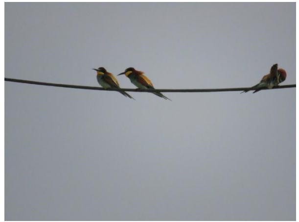
23. European Bee-eater, Merops apiaster