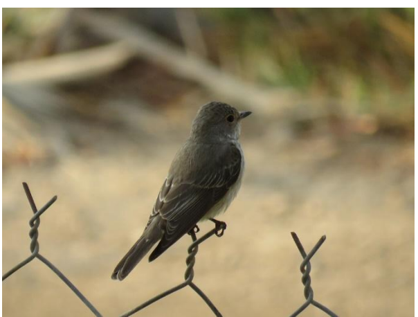
46. Spotted Flycatcher, Muscicapa striata