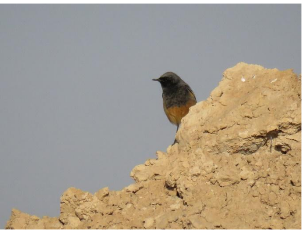
50. Black Redstart, Phoenicurus ochruros