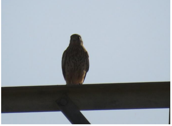
8. Common Kestrel, Falco tinnunculus