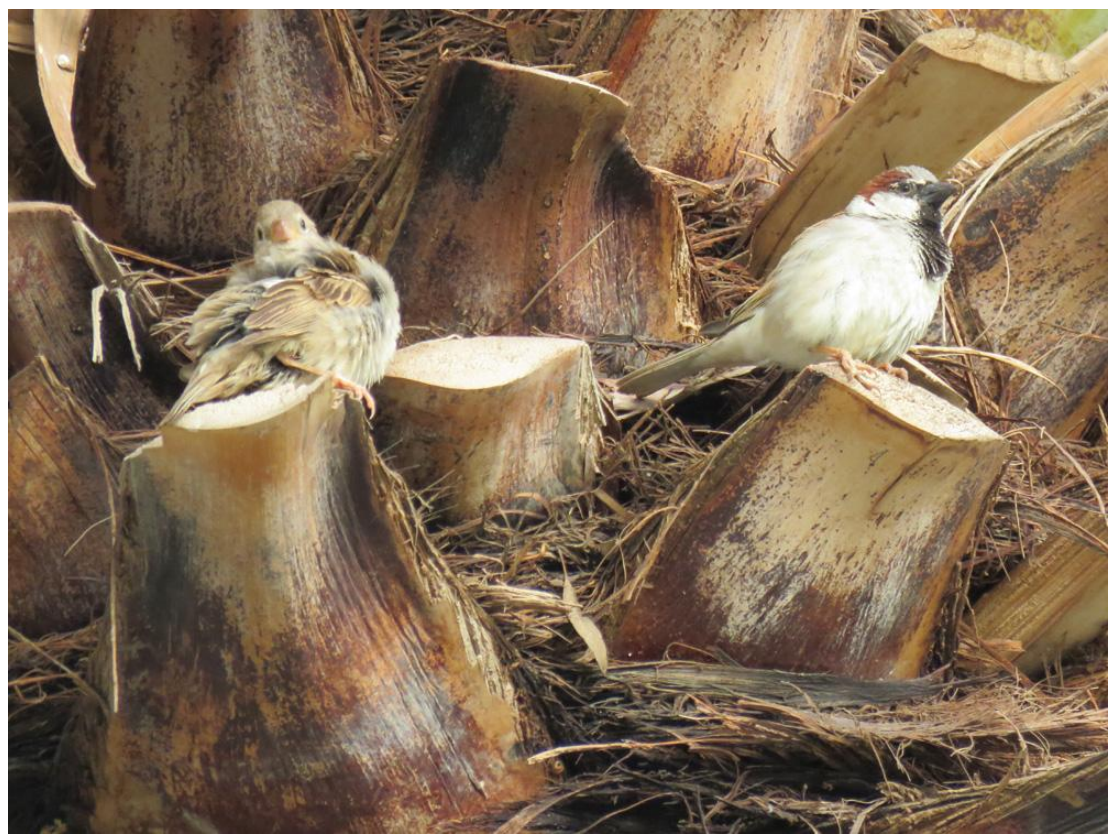
62. House Sparrow, Passer domesticus