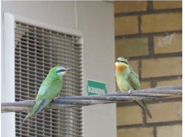
21. Blue-cheeked Bee-eater, Merops persicus