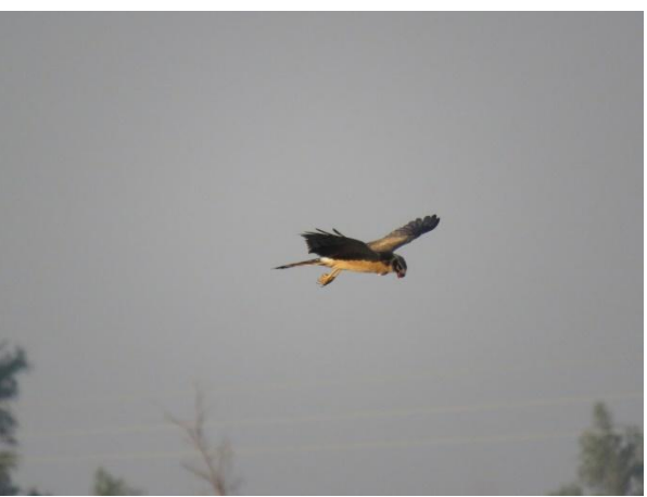
4. Pallid Harrier, Circus macrourus