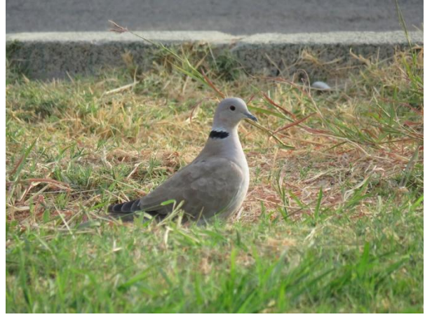
28. Eurasian Collared Dove, Streptopelia decaocto