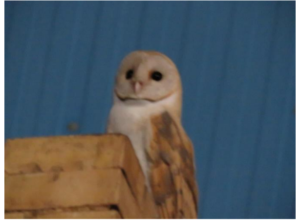
9. Western Barn Owl, Tyto alba