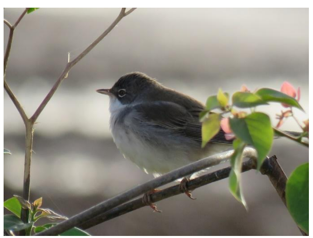
54. Common Whitethroat, Sylvia communis