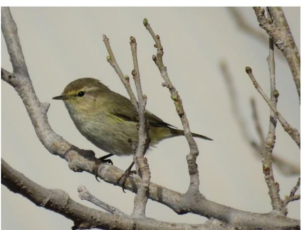
56. Common Chiffchaff, Phylloscopus collybita