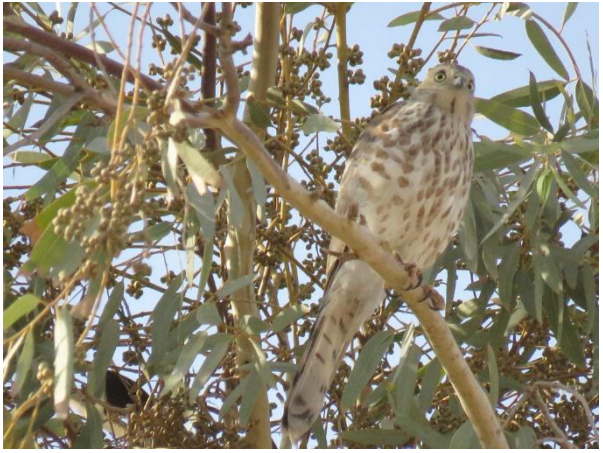
1. Shikra, Accipiter badius

Appendix 1: Photos of bird species in the study area (ASNRUKH), (all photos with the exception of photo 26 were taken by the first author).