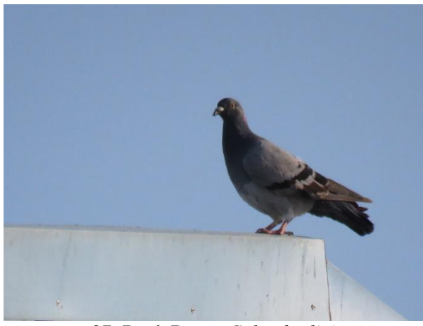
27. Rock Dove, Columba livia