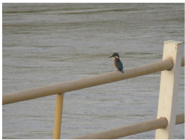
19. Common Kingfisher, Alcedo atthis