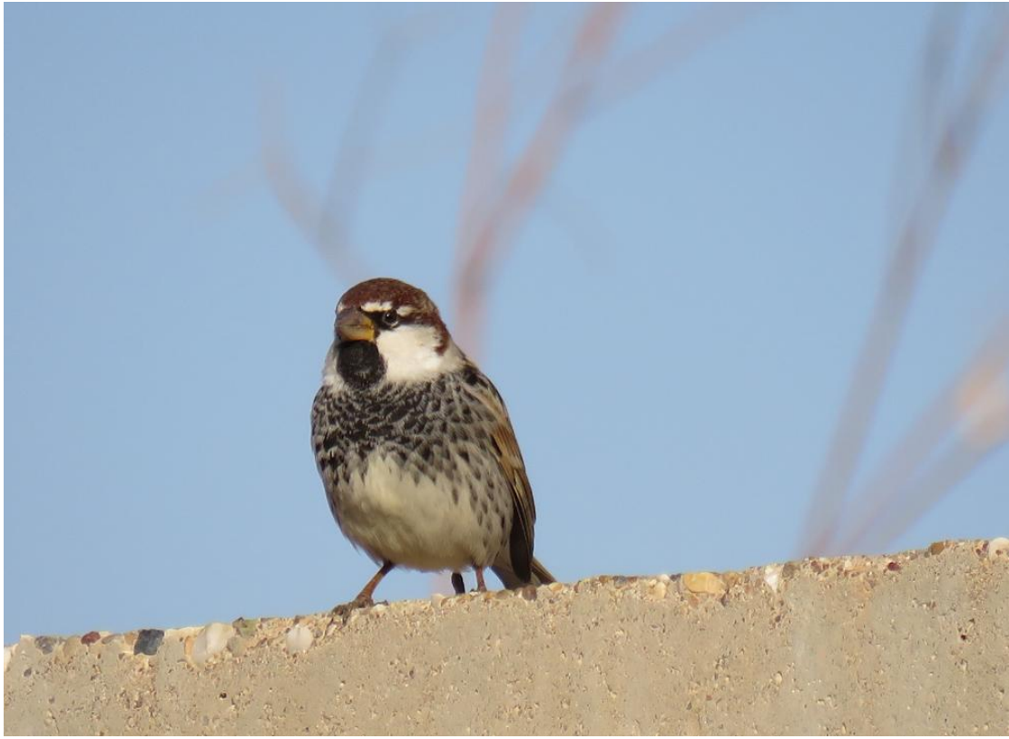
61. Spanish Sparrow, Passer hispaniolensis