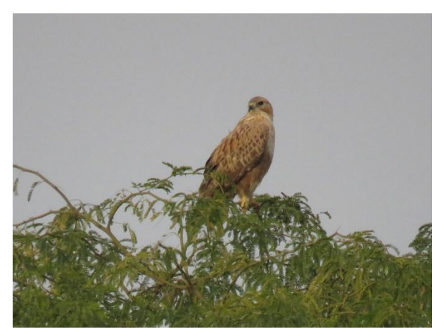
5. Long-legged Buzzard, Buteo rufinus