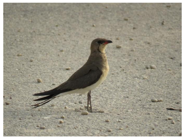
15. Collared Pratincole, Glareola pratincola