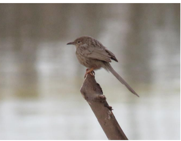
34. Afghan Babbler, Argya huttoni