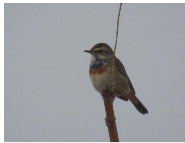
43. Bluethroat, Luscinia svecica