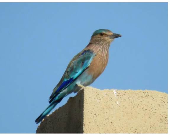
20. Indian Roller, Coracias benghalensis