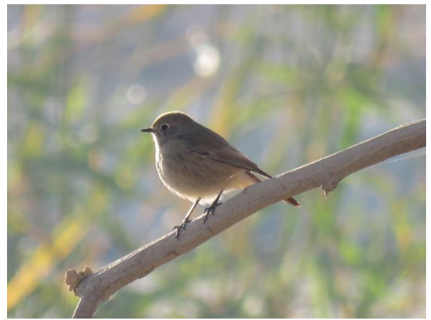
51. Common Redstart, Phoenicurus phoenicurus